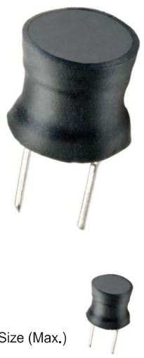
Actual Size (Max.)