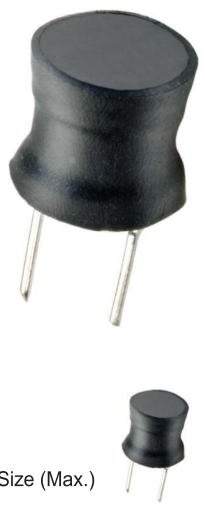
Actual Size (Max.)